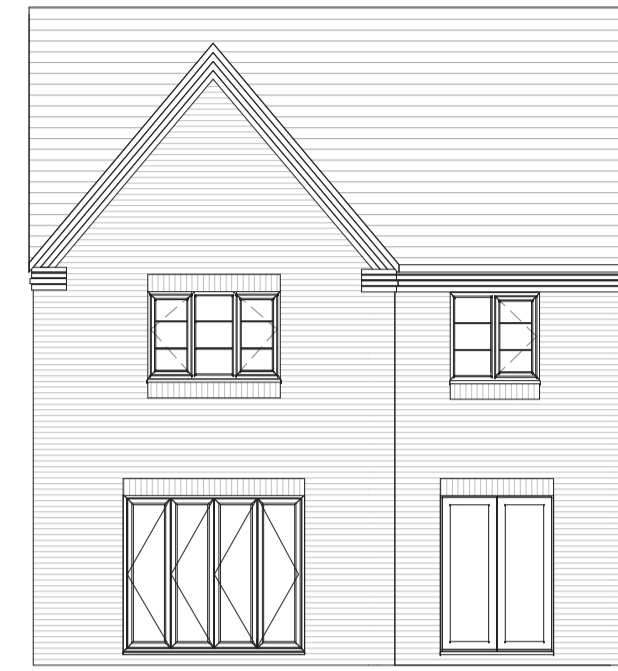
4 Rear Elevation 1 : 100