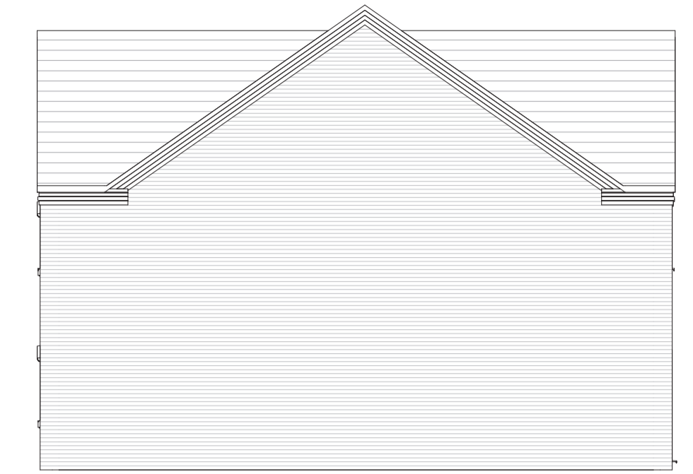
6 Side Elevation 2 1 : 100