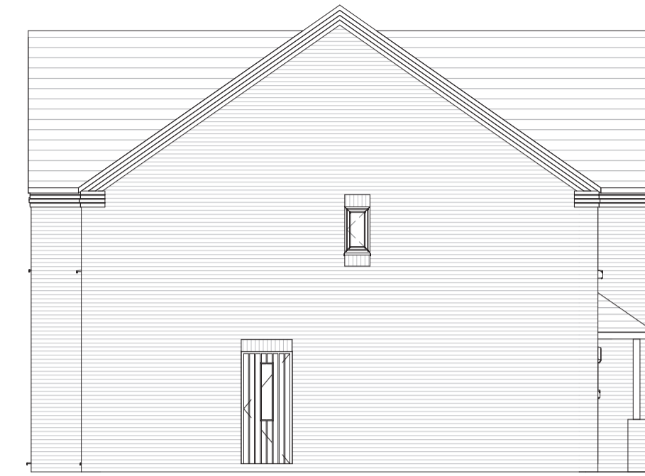
5 Side Elevation 1 : 100