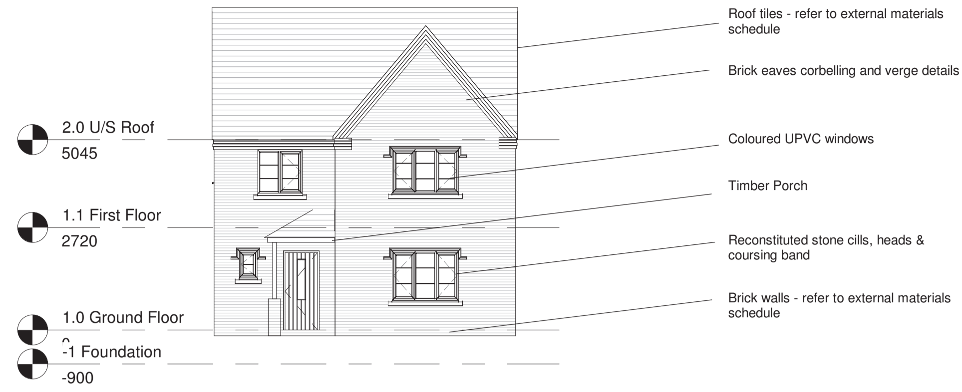
3 Front Elevation 1 : 100